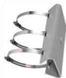
SC-1275ZJ Vertical pole mount